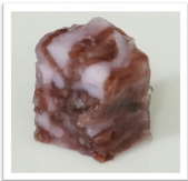
3D bio-printed cultivated marbled beef from Consortium for Future Innovation by Cultured Meat

Japanese cultivated meat "Barbequed" or displayed at the inaugural meeting of JACA