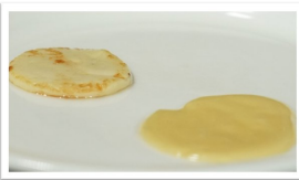
Cultivated chicken from Diverse Farm