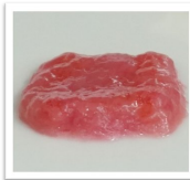
Cultivated beef from Tokyo Women's Medical University-Waseda University Joint Institution for Advanced Biomedical Sciences